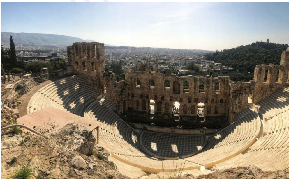
Odeon of Herodes Atticus

Completed in 161 AD, the Odeon of Herodes Atticus is a Roman theatre. It's one of the oldest open-air theatres; an iconic landmark in the Acropolis hill. The theatre is now used to host annual festivals with a 4,500 capacity. This is one of the first landmarks on your way to the Acropolis hilltop. White marble benches and mosaic floors make it a special attraction.