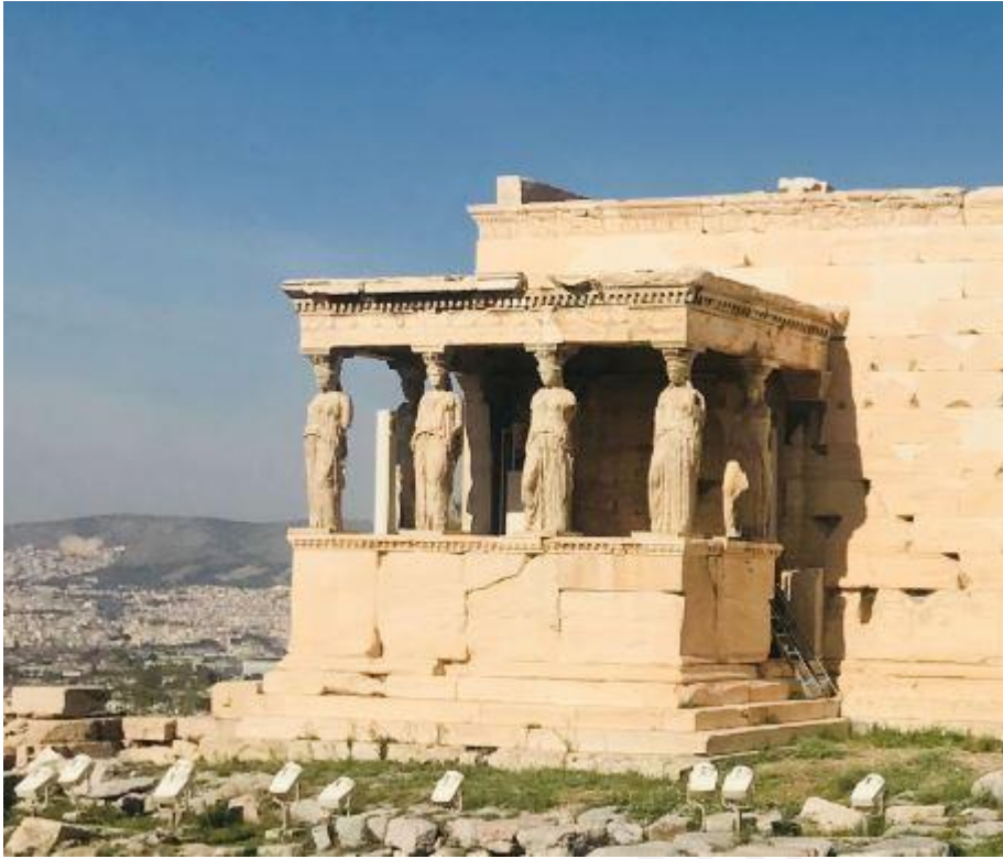
Caryatids in the Erechtheion