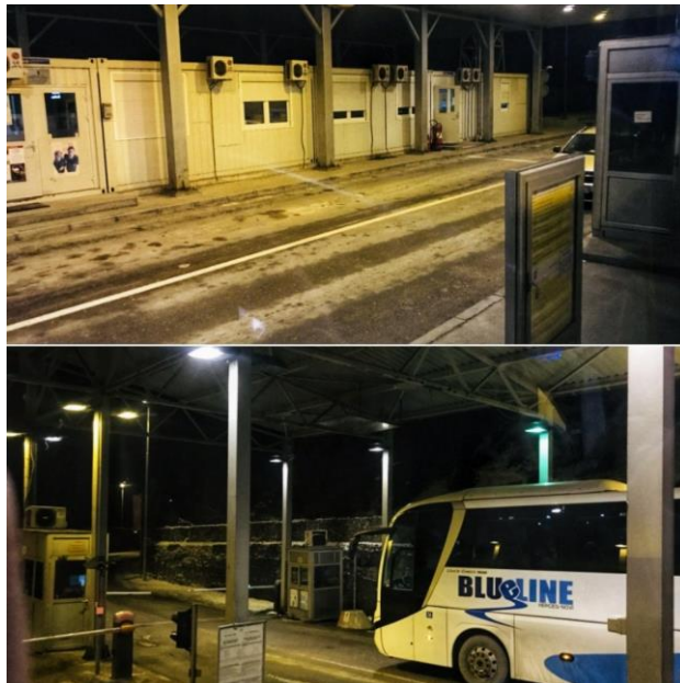
Serbia – Montenegro border crossing

Even though all your travel documents are correct, if someone takes away the passport for verification, you feel anxious. Isn't it?