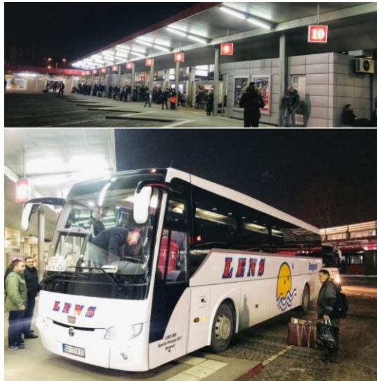
Our replacement bus

Pro-tip: Reach your bus/train station at least an hour before the departure time.