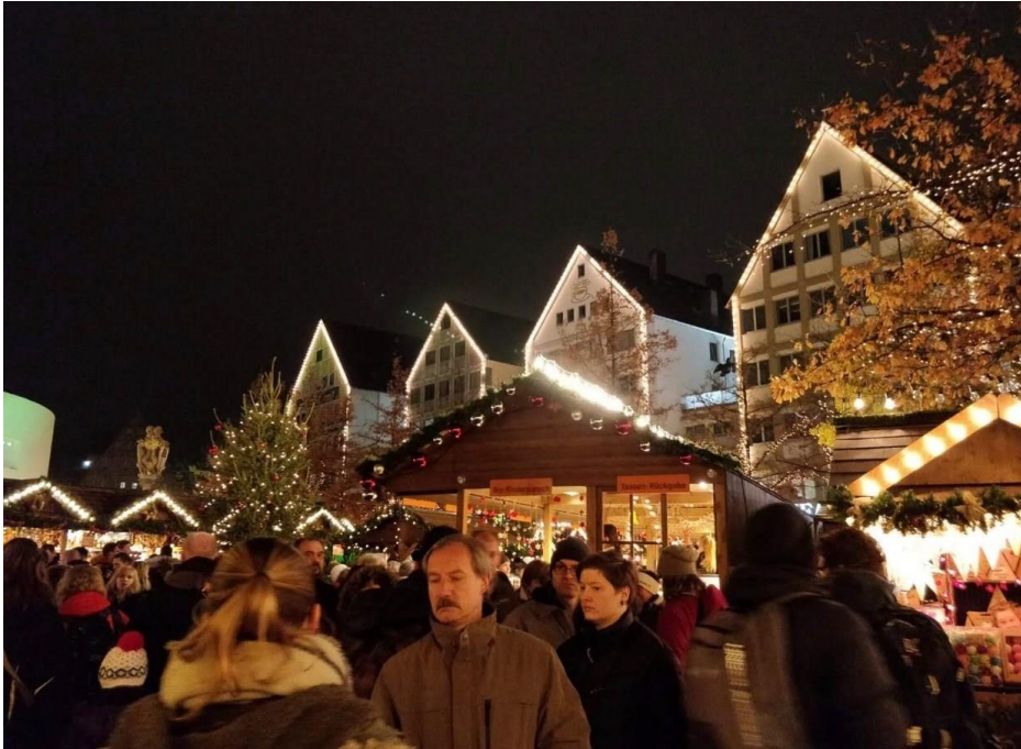
A random picture from Ulm Christmas Market

The Market has many small shops that sell winter wears like woolen socks, gloves, caps, and mufflers. You can also find a variety of decorative articles and many cute items that are essential for the decoration of Christmas trees.