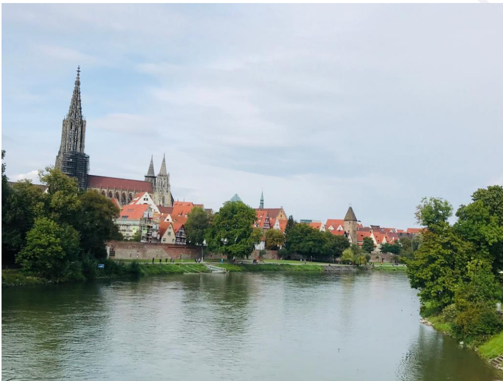
The Danube dividing Ulm and Neu-Ulm

Leaving the past behind, the weekend getaway for most of the Ulmers is on the banks of the river Danube which connects 10 countries but divides 1 city in 2 -Ulm in the state of Baden Württemberg and Neu Ulm in the State of Bavaria.