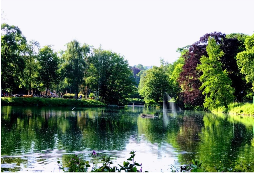
A lake in the park

There are many restaurants and ice-creams parlours inside the park.