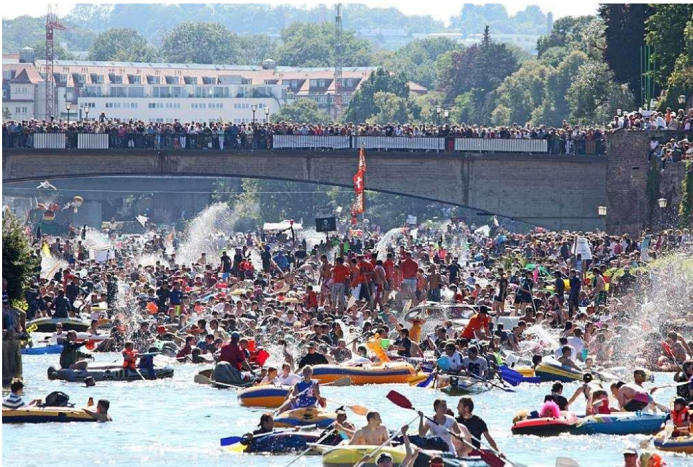
Schwörmontag

At the end of his speech, to the sound of the Oath bell, he promises unconditionally to serve rich and poor equally in all equal, common and honest dealings.