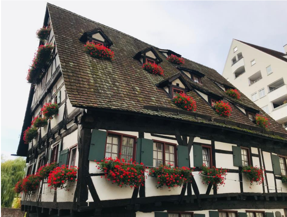
The Crooked house

The house which leans of about 10° is now renovated as a hotel. I am sure you don't want to miss this house as it even holds a Guinness World Record for the " Most Crooked House in the World. "