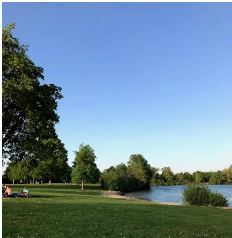
The Ludwigsfeld lake

There is plenty of places to play badminton, volleyball, table tennis and also has a dedicated play area for children.