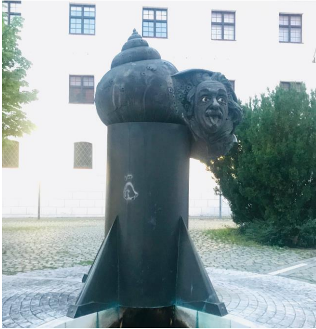
The Rocket Fountain