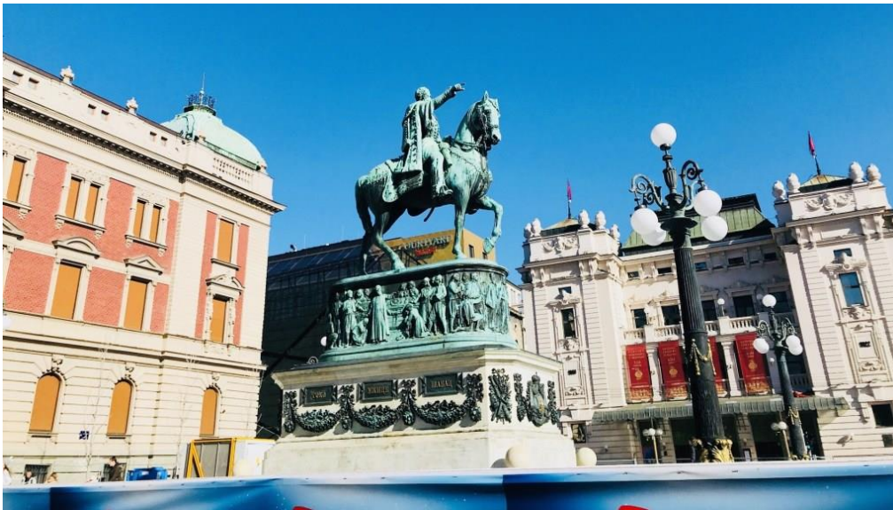
Prince Mihailo Monument in Republic Square

The statue was erected in honour of the Prince's most important political achievement-a complete sacking of the Turks from Serbia in 1867. He is to date marked as one of the greatest historical figures Serbia had. But unfortunately, he was assassinated by his enemies because of the political rivalry. He is buried in the Cathedral square.