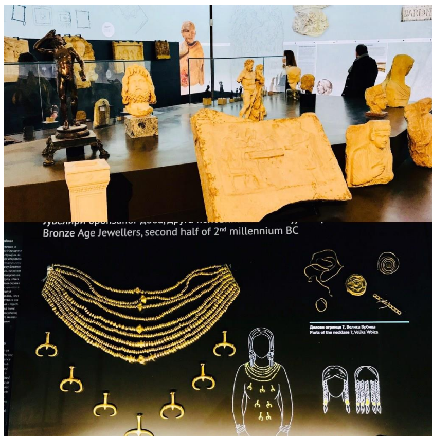
Few artefacts at the museum

The Archaeological section has numerous sculptures, weapons, and helmets from Rome and Greece. The Numismatic Collection has more than 300,000 items like coins, medals, rings, and seals. There are over 16,000 paintings spread across 2 floors with an art collection from French, Dutch, Italian, Russian, German, Japanese, Spanish, Hungarian, Romanian and Bulgarian.