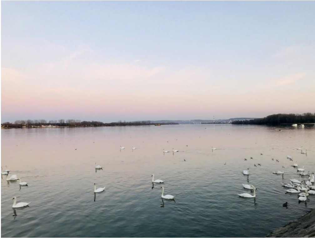
The mighty Danube joining the River Sava

The official currency in Belgrade is ‘Serbian Dinar (RSD)’.