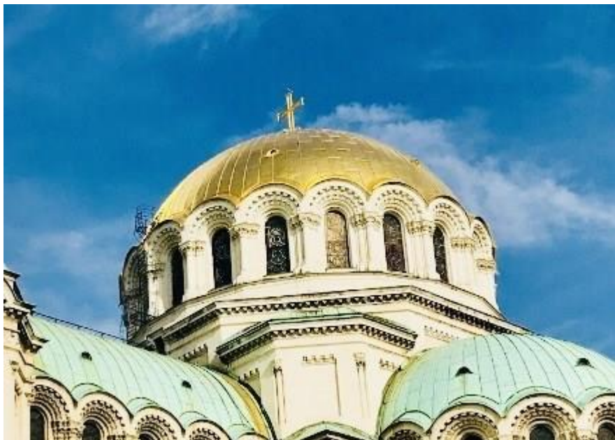
The gold plated dome