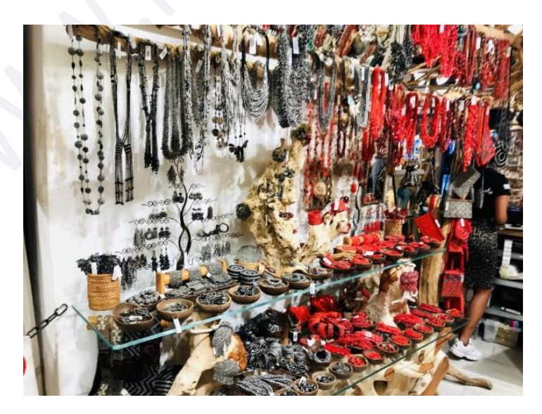
The accessories arranged colourwise

The accessories were arranged colorwise and looked beautiful. The price was on the higher side.