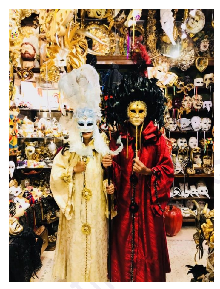
Us in the Venice Carnival Attire

Another special mention goes to the mask shop <u>Tragicomica</u>. You will find it <u>near</u> the Rialto Bridge. It was amazing to see so many masks of different shapes, colors, patterns, and sizes.