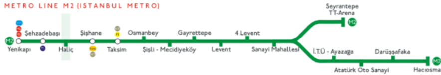
Line M2