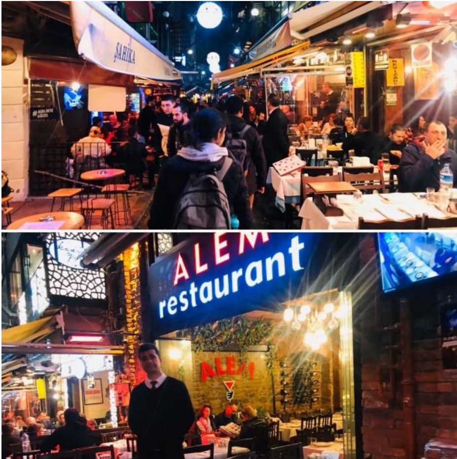
The restaurants in the narrow lanes

Istiklal Street is the main street in Taksim Square where you find all the restaurants, cafes and ice-cream shops. Take your time to walk along this street and enjoy every single shop you pass by. There are many people and full of life just like the streets in Venice . This place automatically recharges you and vibes differently at night.