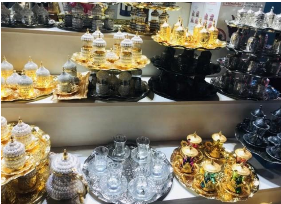
One of the souvenir shops selling Turkish tea set

Other than Grand Bazaar , Taksim Square is the hub for souvenir shopping. All types of souvenirs, sweets, nuts, toys, fruits, vegetables, Turkish tea sets, savouries, hair accessories are available in Taksim square. Istiklal street has high-end brands and not an ideal place for shopping. The narrow lanes are for budget shopping. If you walk into the narrow streets, its very delightful just to see them.