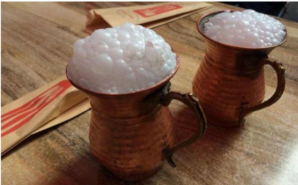
The national drink of Turkey- Ayran

It is a yogurt beverage and the best drink to date, nothing can beat the taste of fresh Ayran. As per sources, Ayran was elevated to the rank of the national drink by Turkish Prime Minister Recep Tayyip Erdoğan in 2013. Every other shop sells packed Aryans which costs 5 TL. But it is better to try freshly made national drink.