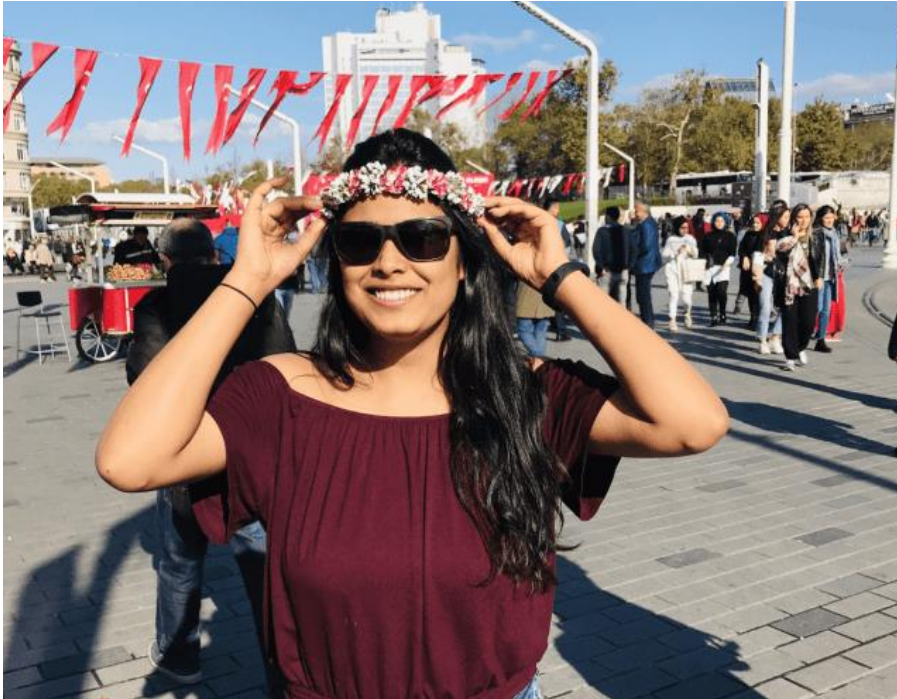
Flaunting the tiara