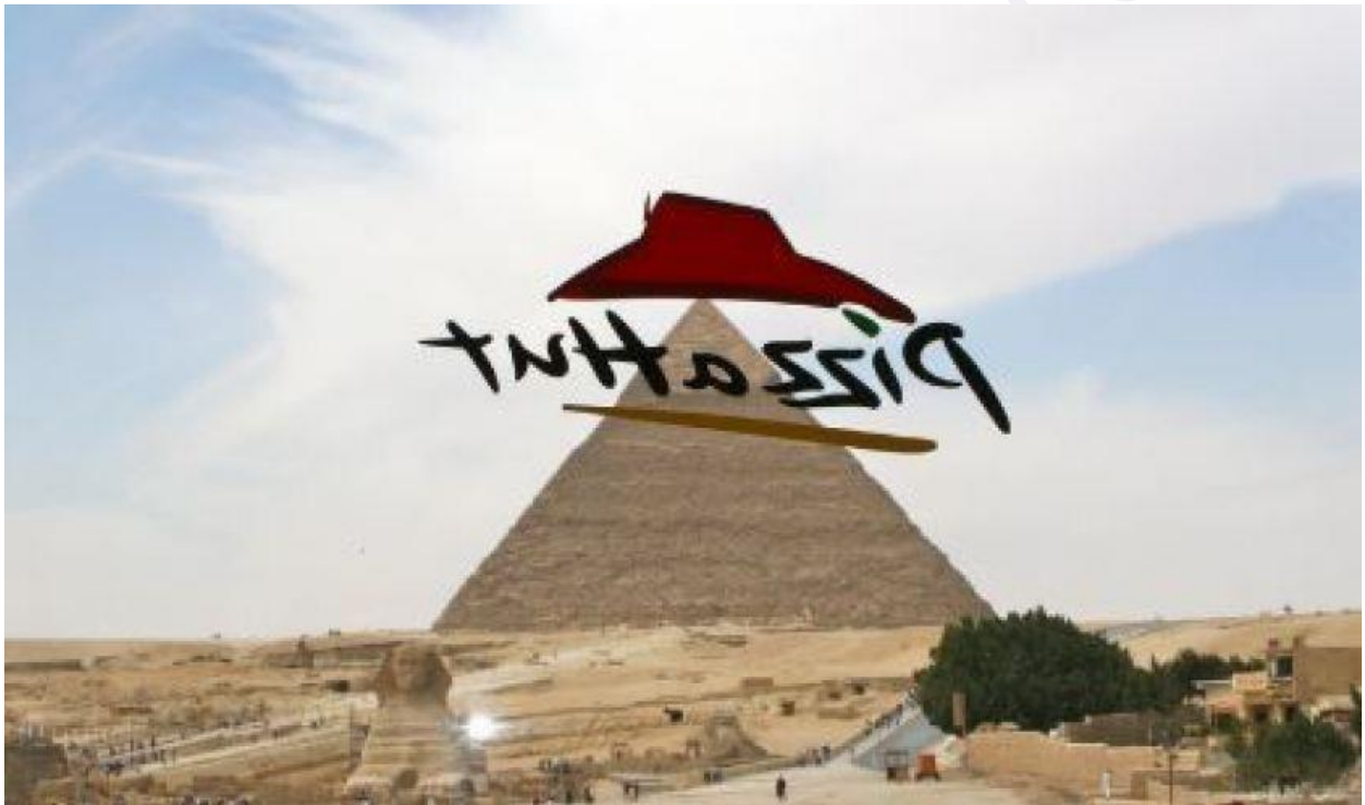
Pyramid view pizza hut

If you are craving for some food, then Pyramid View Pizza Hut is a must-visit. This is located just opposite to the Sphinx entrance. You can enjoy cheese burst pizzas with the world wonder view from the 26th century BC.