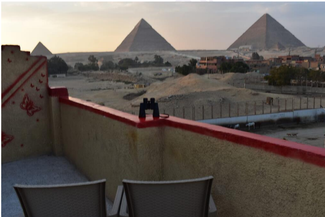
Mondy Pyramid view – Never ever go

If you are opting to stay in Giza with a Pyramid view, choose expensive accommodation. Just because sites like booking.com or Airbnb has an 8+ star rating doesn't mean the accommodation is great and the surroundings are clean. There are many renowned hotels in the city center which also offer a Pyramid view. So go in for safe and expensive accommodation.