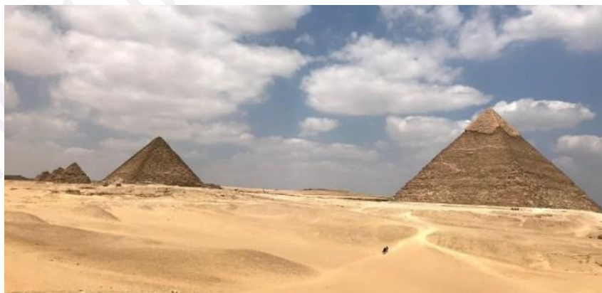
First panoramic viewpoint

Near the Sphinx, there are camel riders by the Government of Egypt. It is recommended that you take a camel from here as we did. Our total ride lasted 1-1.5 hours and we paid 100 EGP per head. It's up to your bargaining skills to make the most out of the camel ride. They agreed for 2 panoramic viewpoints of the Pyramids and trust me, it's worth millions.