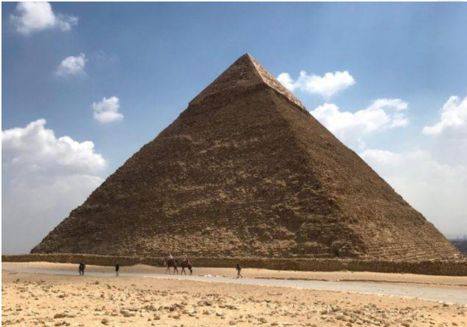
The Great Pyramid

The Pyramids are huge and so fascinating. I was awestruck. This place felt surreal. I had a few poses in mind and didn't waste a single second. I was so excited and started running around as the whole place is picturesque. It is desert everywhere and we just kept walking along to exploring the place. We spent 4 hours just exploring the desert and the Pyramids. It was an experience beyond words.