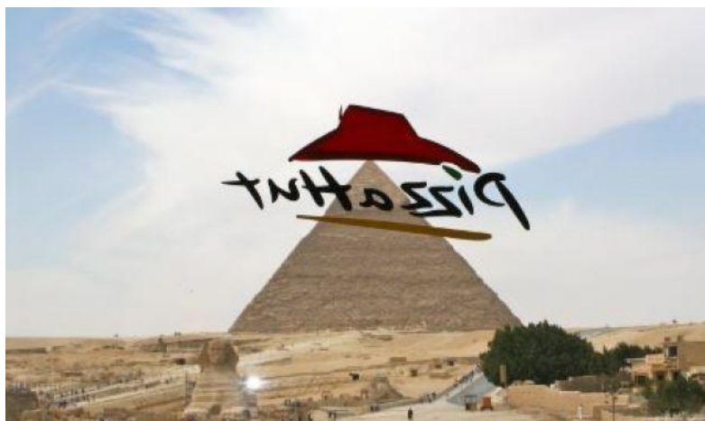
Pyramid view pizza hut

To visualize the entire region, we have a map to help you out. This map is for reference.