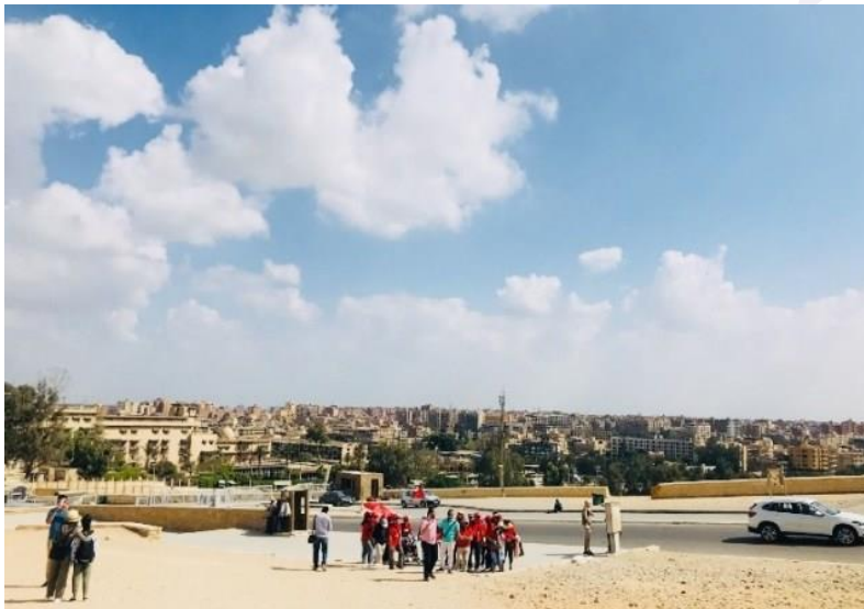
Near the ticket counter

Visit Pyramids of Giza early in the morning because there are chances that you will encounter a lesser crowd and jump the queue.