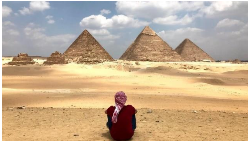
Second panoramic viewpoint

If you take a camel ride initially, confirm the locations where he will be taking you. Do not make the payment initially or you will regret later.