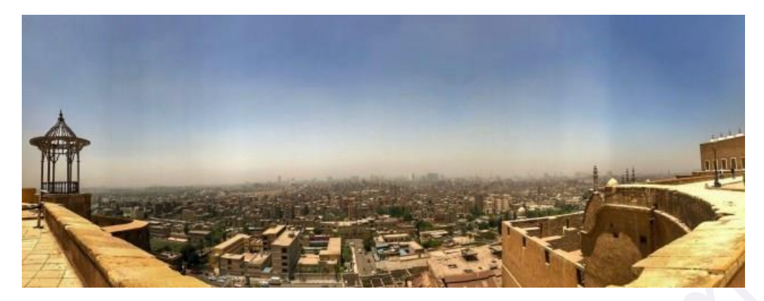
Dusty Cairo city view